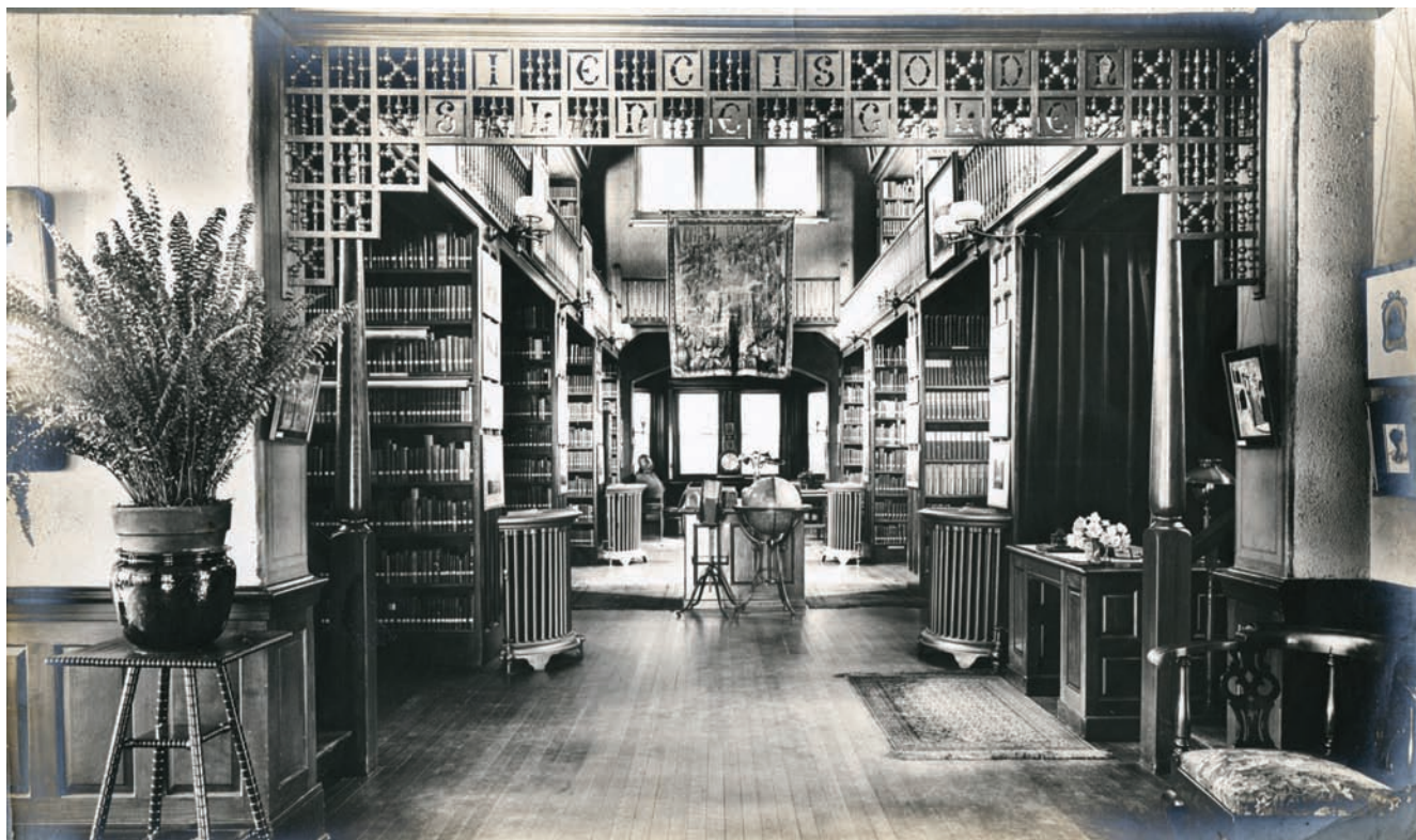
In 1889, one entered the Library under decorative wooden fretwork, which spelled out the words Silence is Golden.