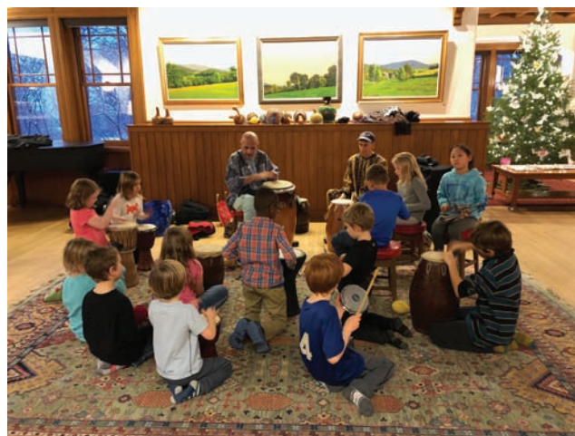
African drum workshop