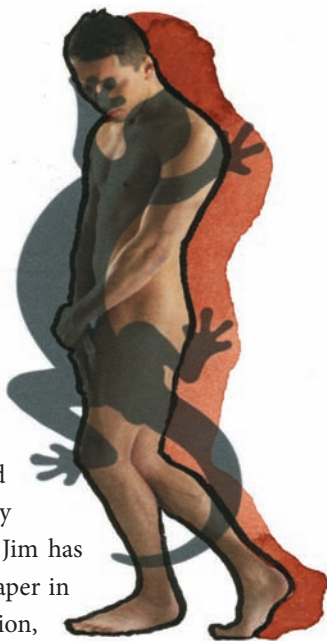
Canto 25: 8th circle, 7th malebolge; theft; Cianfa and Agnello