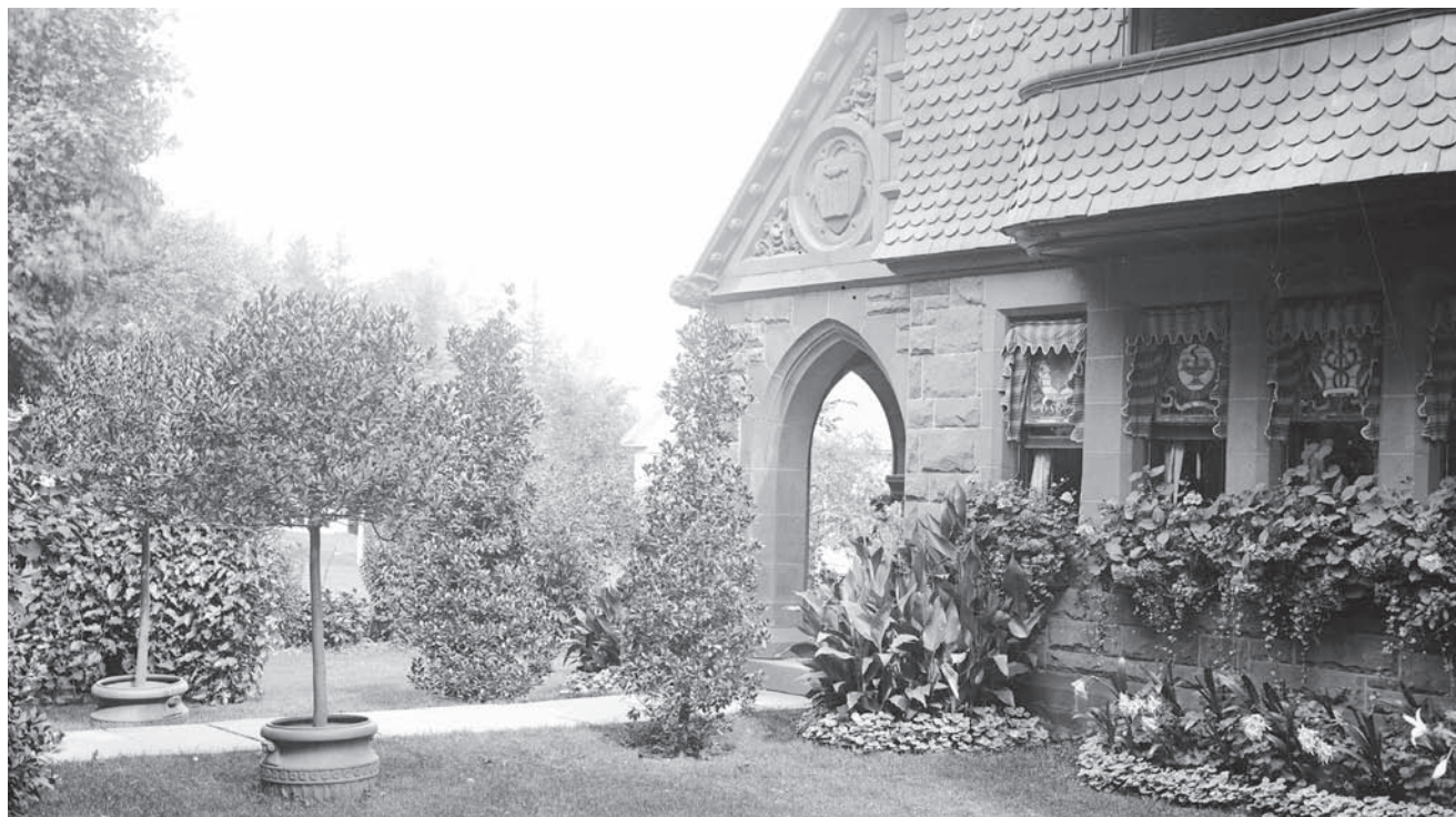
The Library is pictured about 1910 during Isabella Eldridge's era, with lush greenery, potted plants, and flower boxes in the windows, all filled with plants from the Eldridge gardens.