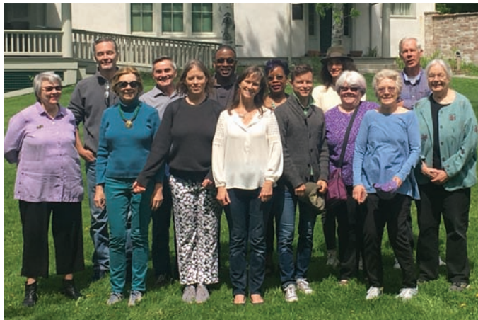
Library day-trippers to Chesterwood in Stockbridge, MA, the home of Daniel Chester French, sculptor of Abraham Lincoln in the Lincoln Memorial.

We were so lucky to host Lúnasa, “one of the best Irish bands on the planet,” for our annual St. Patrick’s Day celebration just before they returned to Ireland.