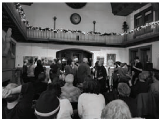
Among several outstanding concerts this winter, Berkshire's Bossa Triba brought the audience to the dance floor with the rhythms of Brazilian samba.