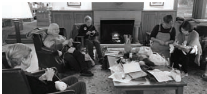
The fire was lit in the Great Hall while the Norfolk knitters knit hats, mittens, and scarves for those less fortunate.