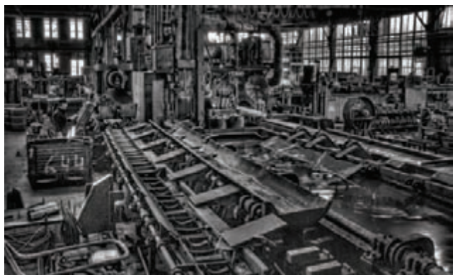
American Brass factory, Waterbury