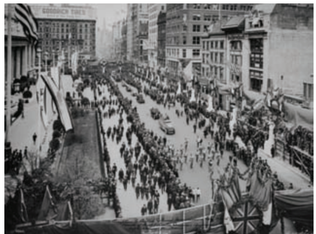
Parade in front of the New York Public Library, May 9, 1917. Note the large medallion in the lower right corner.