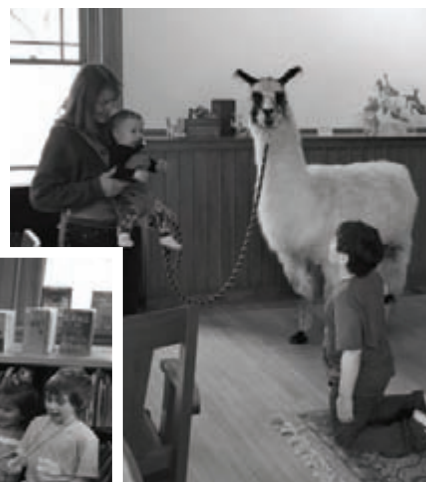
A llama visited the library for Corner Club, a first!