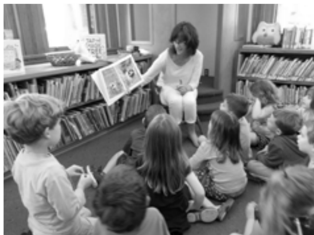
Botelle Kindergarten children visited the library for a special story time.