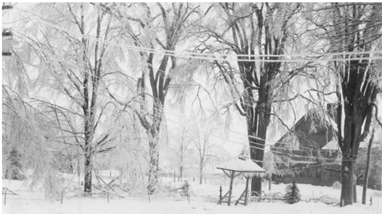
The Library is encased in ice following the ice storm of February 20-22, 1898, documented by Norfolk photographer Marie Kendall.