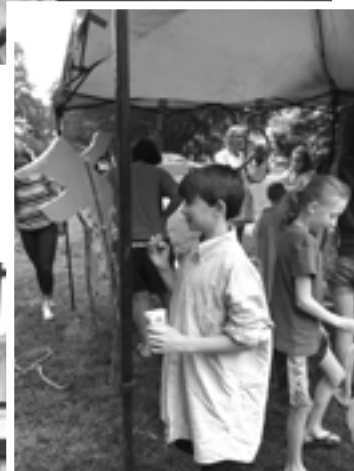
Children paint fantastic flying birds during Summer Reading