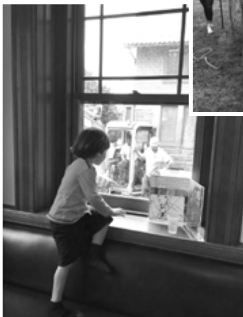
Not everyone was bothered by noisy drilling this summer. Some of our youngest friends were fascinated by the big machines at work.