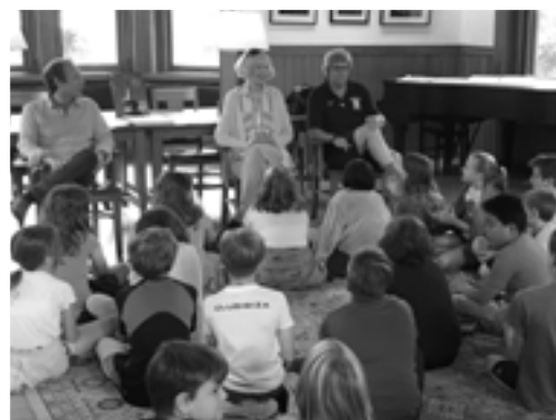
Norfolk photographers discuss their work with Botelle students.