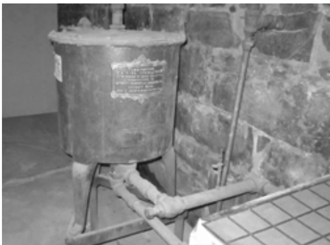
Combination Mixing Regulator found in the library basement

From The Director ..... 2 Exhibition ..... 4-5